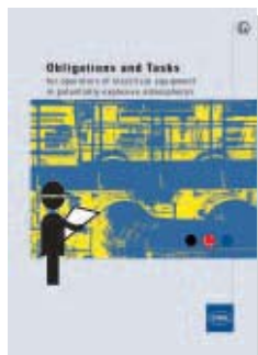
Obligations and Tasks for operators of electrical equipment in potentially explosive atmospheres