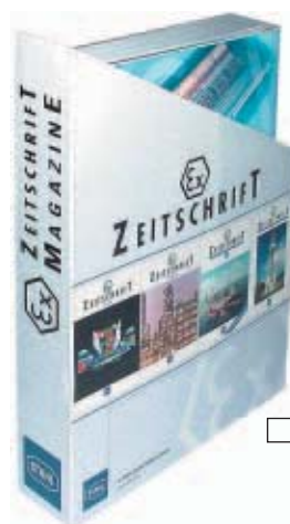
Folder for Ex-Magazine

R. STAHL Schaltgeräte GmbH Marketing Am Bahnhof 30 74638 Waldenburg (Württ.) - Germany Fax: +49 79 42 / 9 43 - 40 4300