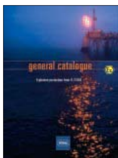
Explosion Protection by R. STAHL General catalog by R. STAHL