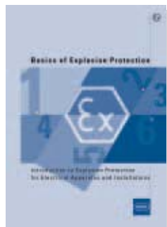
Basics of Explosion Protection Introduction to Explosion Protection for Electrical Apparatus and Installations