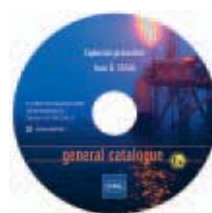
Explosion protection by R. STAHL on CD ROM General catalog by R. STAHL