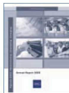
Annual Report 2002 of R. STAHL AG