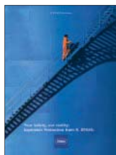
Explosion Protection by R. STAHL Company brochure of R. STAHL Schaltgeräte GmbH