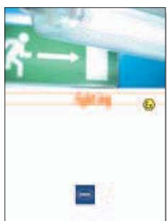
Illuminate Our competence in Explosion protection