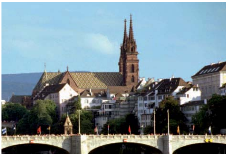
Figure 1: General view of Basle