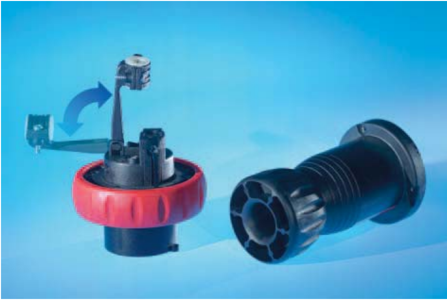
Figure 4: Socket with inboard, hinge-down strain relief

→ Frequently, plugs and sockets are installed at a large distance from the sub-distribution board, thus necessitating laying long supply cables with a larger cross-section.