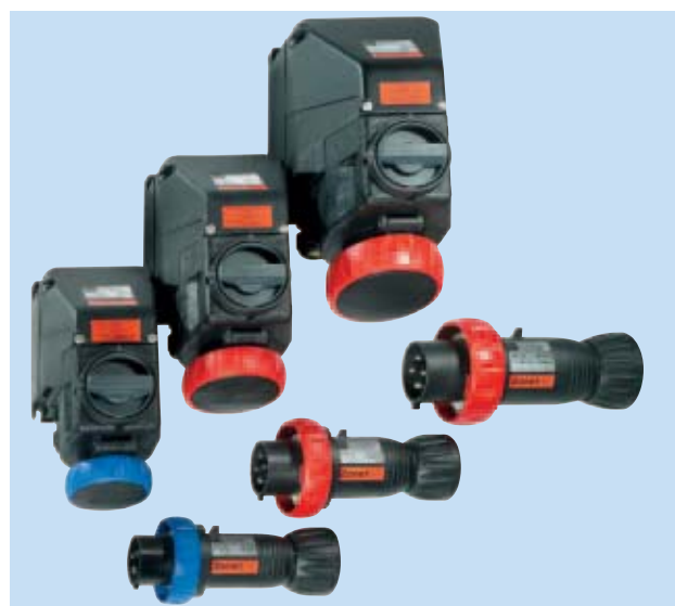
Figure 7: SolConeX-plug and socket system 16A and 32 A