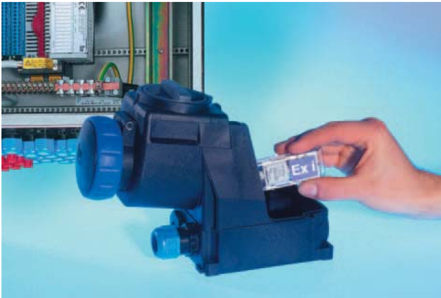
Figure 5: SolConeX with Ex i-auxiliary contacts for integration in automation systems

SolConeX as the first plug and socket system on the market to date with 2 optional auxiliary contacts suitable for intrinsically safe circuits.