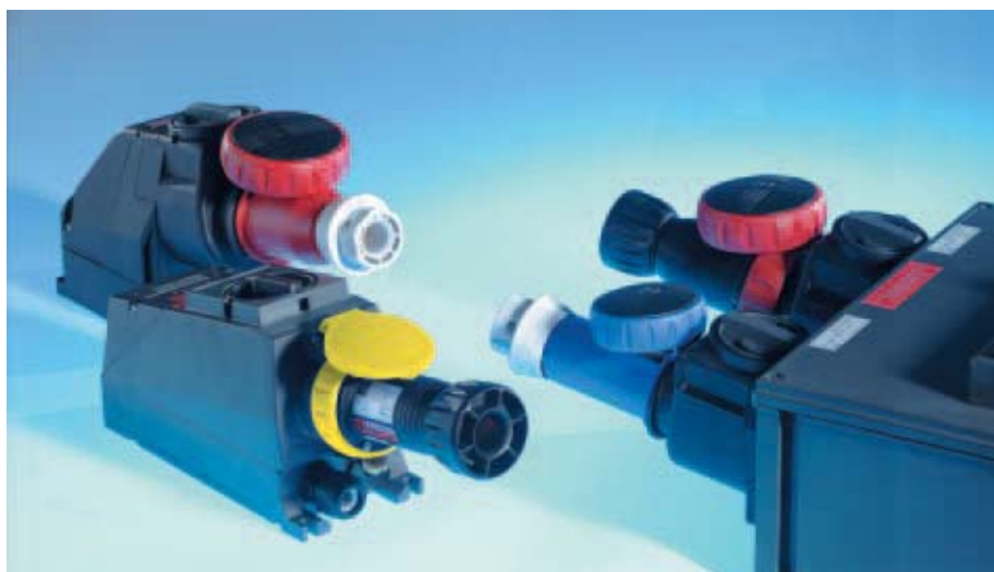
Bild 6: 100% Compatibility of SolConeX and the existing CES-series

Coupler sockets for extension cables are to follow as an extension of the SolConeX Series.