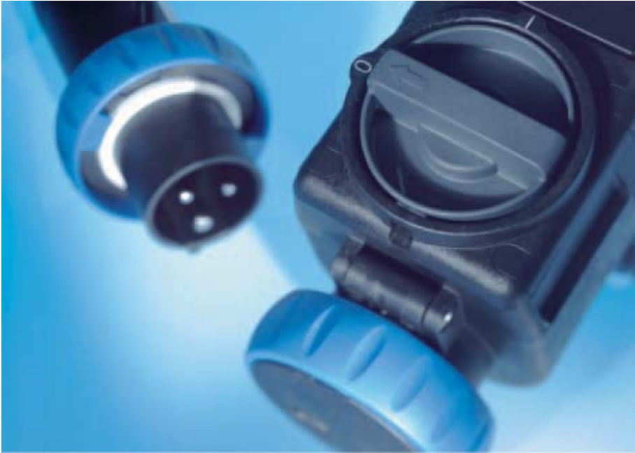
Figure 1: SolConeX – the new series of plug and sockets

With its new SolConeX Series, R. STAHL presents an innovative successor to the successful CES Series of explosion protected plugs and sockets up to rated current 16 A and 32 A (Figure 1). The new plugs and sockets provide optimised benefits to the customer by incorporating the experience of many users and represent what is currently the most up-to-date product series in this sector.