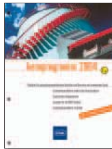
Condensed Catalogue Explosion protected electrical apparatus intrinsically safe components and systems for instrumentation