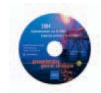
General catalogue on CD ROM - Explosion protection by R. STAHL

Please send me documents on / I would like to consult your team: