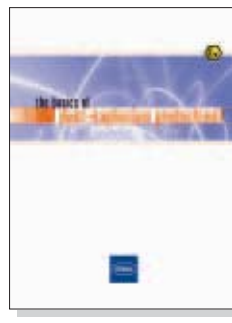
Dust-explosion protection Introduction to Explosion Protection for Electrical Apparatus and Installations