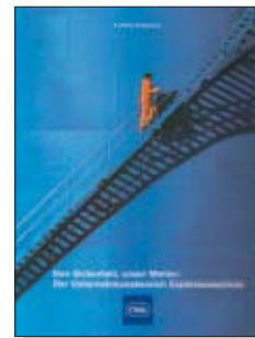
Explosion protection by R. STAHL Company brochure of R. STAHL Schaltgeräte GmbH