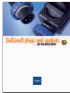
SolConeX - Explosion protected plugs and sockets