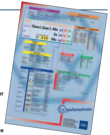
Folder for Ex-Magazine