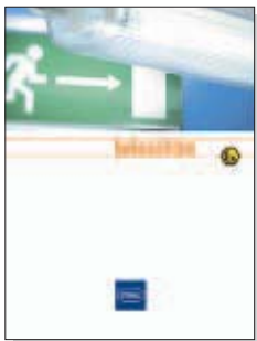
Illuminate Our competence in Explosion protection