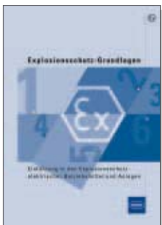
Basics of Explosion Protection Introduction to Explosion Protection for Electrical Apparatus and Installations