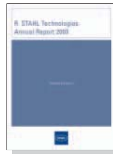
Annual Report 2003 by R. STAHL AG