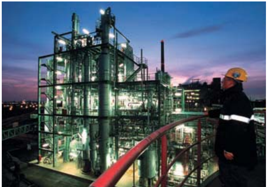
Figure 1: Industrial plant of Bayer Industry in Ürdingen, at night

Directive 1999/92/EC [1] containing minimum requirements for ensuring health and safety in installations with hazardous areas, which was adopted by the European Parliament and the Council in late 1999, has now been adopted in national law by the Member States of the Community and determines explosion protection measures in practice. In Germany this Directive was adopted in German law, together with a number of other Directives on health and safety, by the Betriebsicherheitsverordnung [2] in 2002.