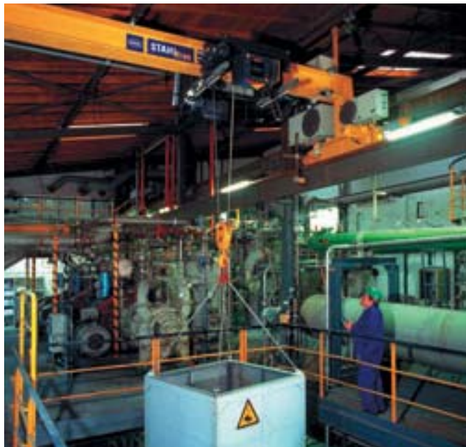
Figure 1: Explosion protected crane installation

European Standards on explosion protected, non-electrical equipment (EN 13463-1 [1] and related Standards on types of protection) are developed to allow compliance with the essential health and safety requirements of Directive 94/9/EG [2]. This is why the explosion protective measures, as demanded by the Directive, are stipulated as a function of possible ignition hazards, and fault statuses are to be allowed for. While Standards whose defined requirement profiles avoid the major types of ignition sources for a specific Equipment Category (EN 50014 ff. [3]) have already been in existence for twenty years now, this does not apply to non-electrical equipment. An ignition