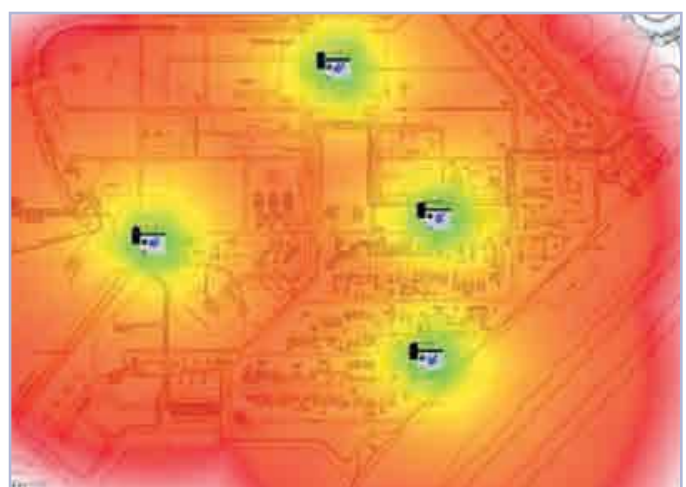
Figure 5: Planning the RF coverage using a ground plan