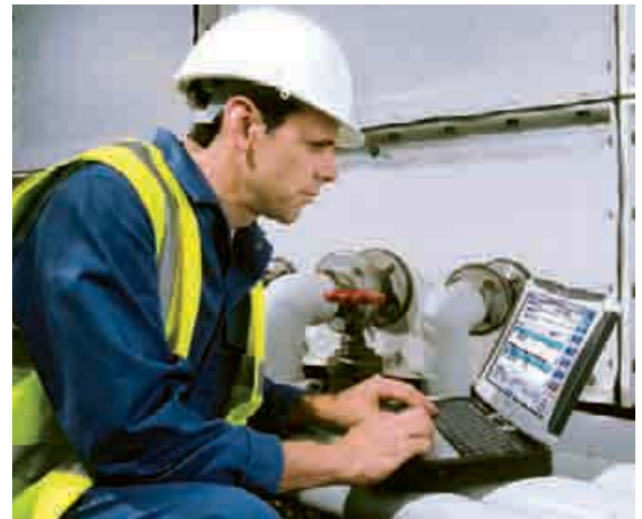
Figure 2: Usage of industrial notebooks for maintenance

ZigBee enables data to be transmitted at a rate of up to 250 kbit/s and requires significantly less power in operation than Bluetooth or WLAN. The protocol profiles approved up to now by the ZigBee Alliance are tailored to applications in building automation. It is currently unclear in which direction ZigBee will develop. ZigBee forms the basis for the wireless HART protocols and some wireless solutions with self-configuring, meshed wireless networks, so-called wireless sensor networks. To increase the immunity of ZigBee to interference, the frequency hopping technique familiar from Bluetooth is used.