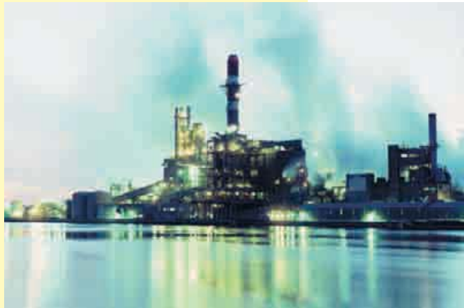
Figure 1: Typical environment for the use of wireless solutions in the process industry