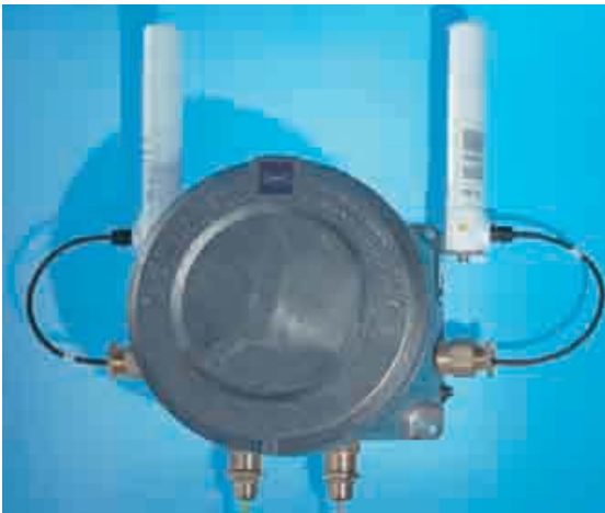
Figure 3: WLAN access point in flameproof enclosure for use in Zone 1