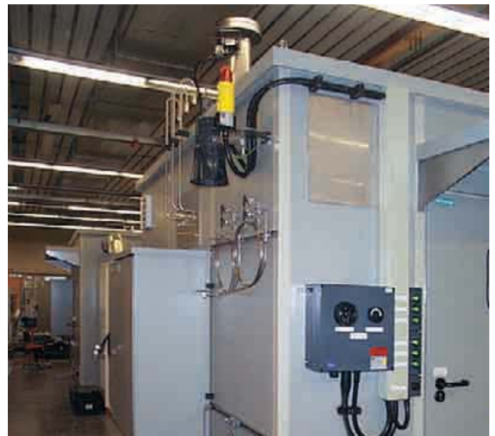
Figure 5: Explosion-protected apparatus installed on the exterior: disconnecter, local reset, control unit with indicator lamps, flashing light and horn

On the system from Siemens a gas alarm is issued at 10 % of the LEL. This device gives the operator time to take action to ensure the shutdown conditions defined in the standard are not reached. If 20 % of the LEL is reached, wall mounted power sockets without explosion protection and other unprotected equipment are shut down. →