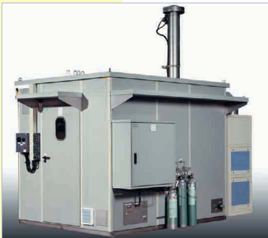
Figure 1: Analyser house (TVR – Transportable Ventilated Room) suitable for desert conditions with explosion-protected equipment installed on the exterior

Gas analysers are used for the continuous on line measurement of the composition of process flows in chemical production systems. These measurements provide support to key process functions of controlling and monitoring the temperature, humidity, and chemical composition of gases and liquids.