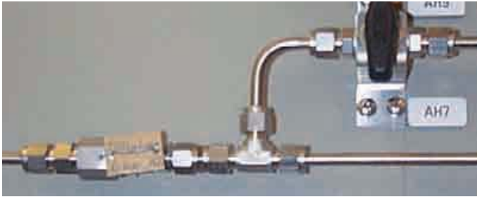
Figure 3: Sealed flow restrictor valve

If 60 % of the LEL is reached, after a defined time all equipment including explosion-protected switchgear in the interior must be shut down. In the standard it is stated that, if within a certain amount of time (e. g. 24–72 h), no attention is paid to the indication, careful consideration must be given to whether this shutdown of the explosion-protected equipment is necessary. The hazard due to reaching 60 % of the LEL in the interior of the analyser room may be less than the possible hazard due to an emergency shutdown of the entire process. With this note in the standard, the fact is addressed that it is essential that the installation be maintained on the presence of a fault over a very long period. An alarm in the transportable ventilated room is indicated visually and acoustically inside and outside, and in manned control centres, e. g., the control station.