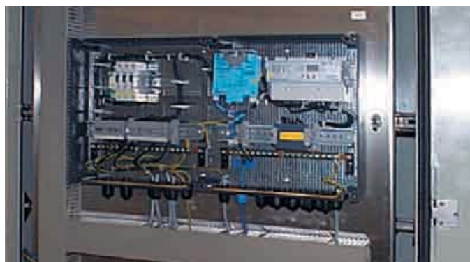
Figure 4: Control system with restricted breathing (open) for monitoring the gas concentration

After putting into service, a safe installation is available on site that complies with all the requirements stated above. The measured data required are provided, the installation can be entered without hazard, and safe operation in the explosion hazardous area is ensured. The safety system itself can be installed in Zone 1 or Zone 2, and in the safe area by the simple adaptation of the function and the selection of the electrical equipment. The process in the reactor can be safety controlled at the explosion limit.