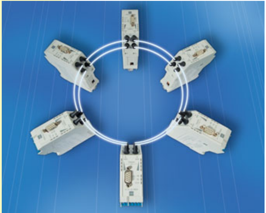
Figure 1: The isolating repeater ISpac 9186 makes it possible to configure ring structures or point to point connection for signals

An undisputed trend in process automation is the usage of field devices that provide the user with ever increasing amounts of information. This growth is justified by increasing functionality, as well as, the users desire to monitor the state of the equipment (asset management). There are many examples of this, such as remote I/O systems, operator interfaces, scales, and so on. For years Profibus DP has played a key role in the integration of these field devices into the automation structure, as is clearly demonstrated by the large base installed worldwide. Along with classic transmission using special copper cable, another medium has become established: optical fibre. In