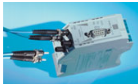
Figure 4: Plug and unplug without risk - with Ex op is