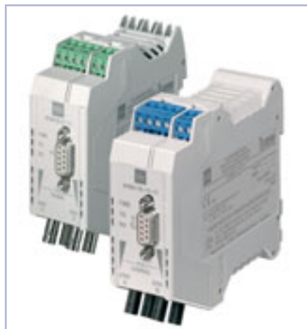
Figure 2: Isolation repeater ISpac 9186 for Profibus or Modbus with optical transmission

Long before the standard IEC EN 60079-28 came into force, R.STAHL developed products for the transmission of Profibus DP signals in hazardous areas based on the principle of inherently safe optical radiation. →