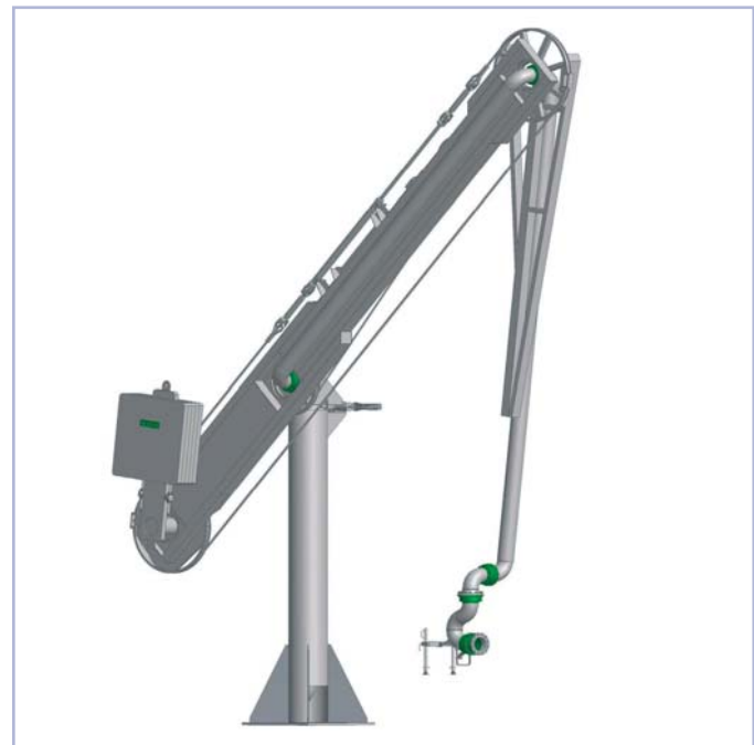
Figure 2: Loading arm with rotating counterweight