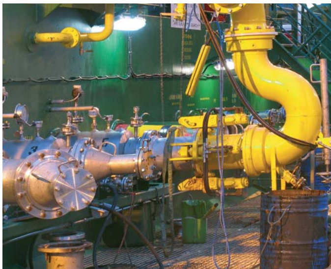
Figure 4: Hydraulic quick coupler

Until recently, the symmetric design was only available for self bearing product piping, and not for a configuration using separate support construction, as is needed in cryogenic applications such as LNG. This achievement provides the benefits of symmetric design to every possible application.