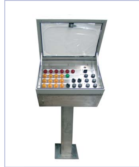
Figure 6: Local operator terminal, Electromach BV