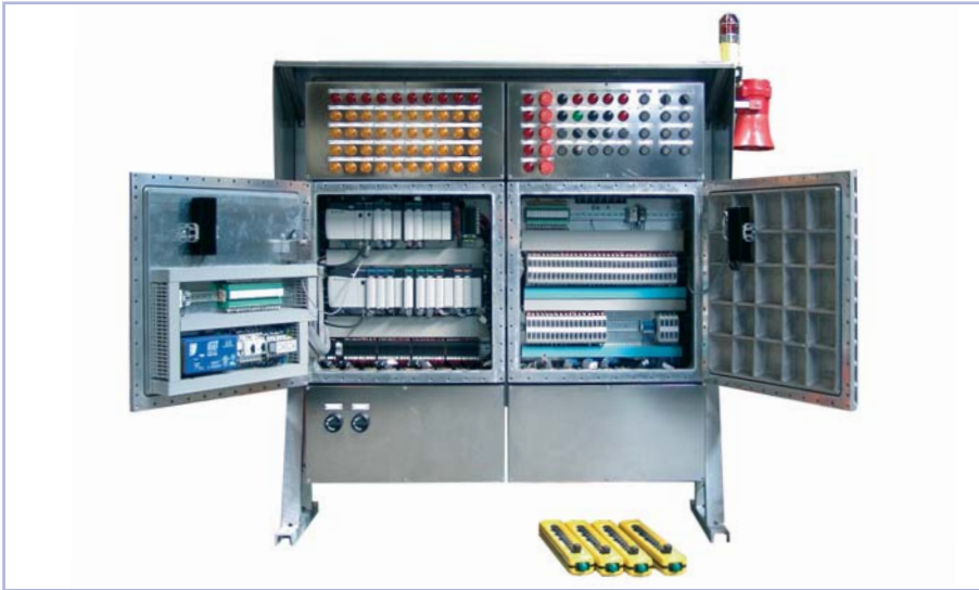
Figure 5: Explosion protected control panel for loading arms, Electromach BV