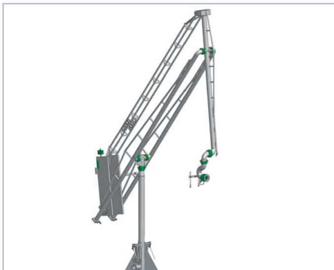
Figure 3: Symmetric design of the loading arm