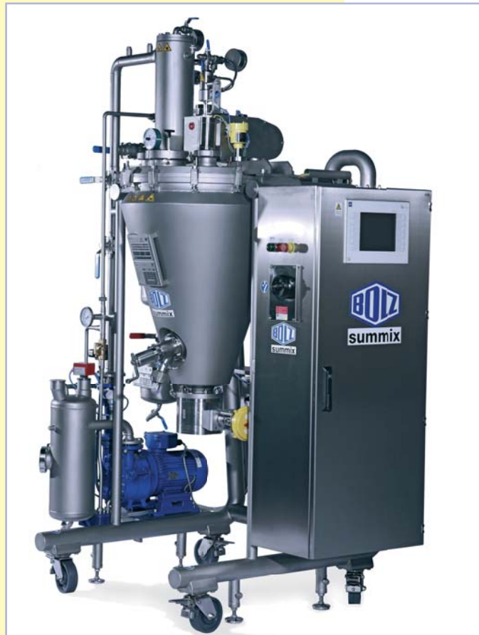
Figure 1: Explosion protected series ML pilot drier with explosion protected control system in stainless steel cabinet

The name BOLZ-SUMMIX® from Wangen in Allgaeu Germany is synonymous with the supply of drying and mixing systems for the pharmaceutical, fine chemicals, food and metal industries. BOLZ-SUMMIX®, a member of the MPE Group, has been producing cone-screw dryers and mixers for many years. Cone-screw dryers are vacuum contact dryers that, with their fully enclosed design and indirect heating, are well suited to processing hazardous or toxic powders wet with solvents or water. In these agitated dryers residual moisture levels of a few ppm can be easily achieved.