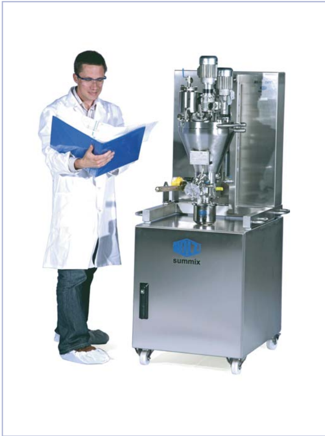
Figure 4: BS-miniDRY® for very small quantities of product

The pilot driers/mixers are not tied to a fixed location; they are intended for mobile use and for this purpose are ready to plug in. The patented conical vessel can be lowered and makes visual inspection easy; thorough cleaning is also possible due to an ergonomic working position. With a total height of 1.850 mm and a width of 1.400 mm in the transport position, a 30 litre pilot drier can be moved from laboratory to laboratory without problems.