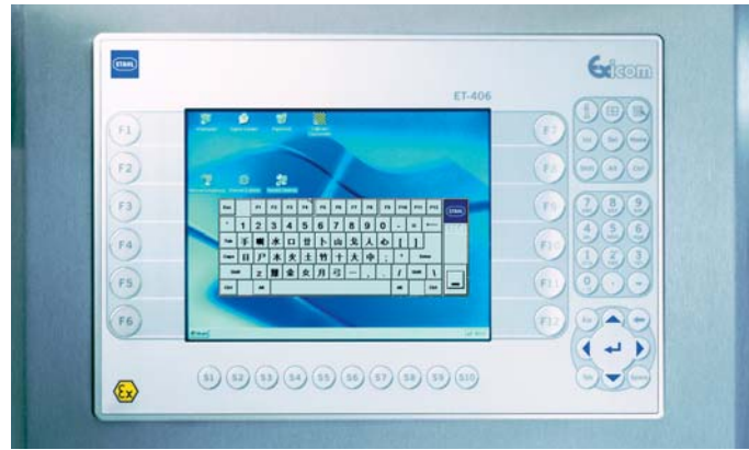
Figure 2: Explosion protected operator terminal ET 416

The Programmable Logic Controller (PLC) and other power equipment that have a source of ignition in operation are installed in a flameproof Cubex enclosure of type 8264. The connections are made via an enclosure in type of protection increased safety »e«. The parameters are entered and the results displayed via the explosion protected HMI Terminal ET 416 manufactured by R.STAHL HMI (Figure 2). The terminal, the Cubex enclosure, a flameproof emergency